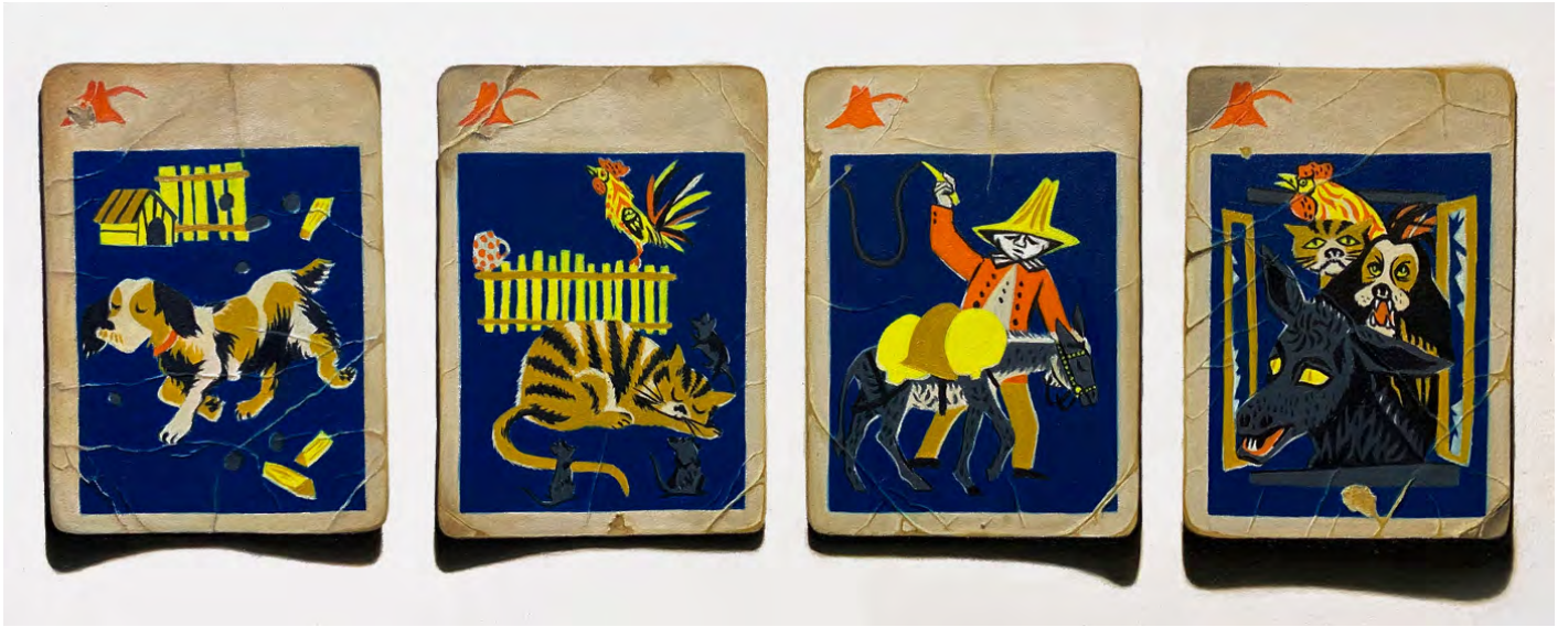
The Bremen Town Musicians by Alexia Novella Oil on Panel 30x20 cm $750 SOLD