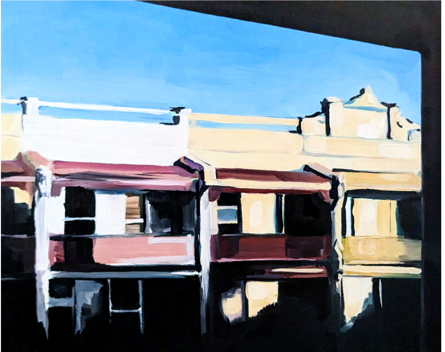
View from Rae Street by Nicole Willis Oil on wood, framed 27.5 x 22.5 $380