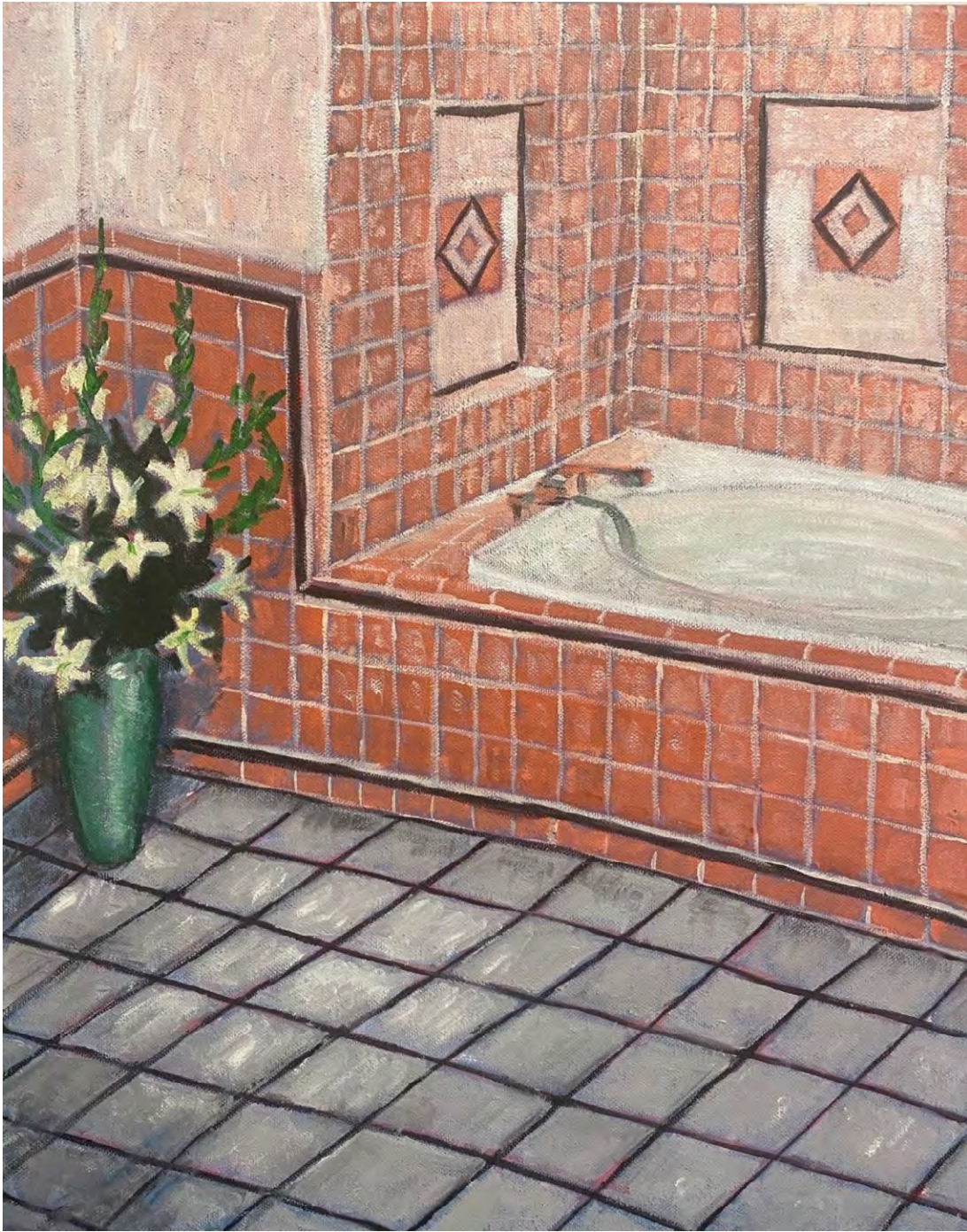
Bathroom with Flowers by Ben Taylor Oil on canvas, framed 40cm x 50cm $720 SOLD