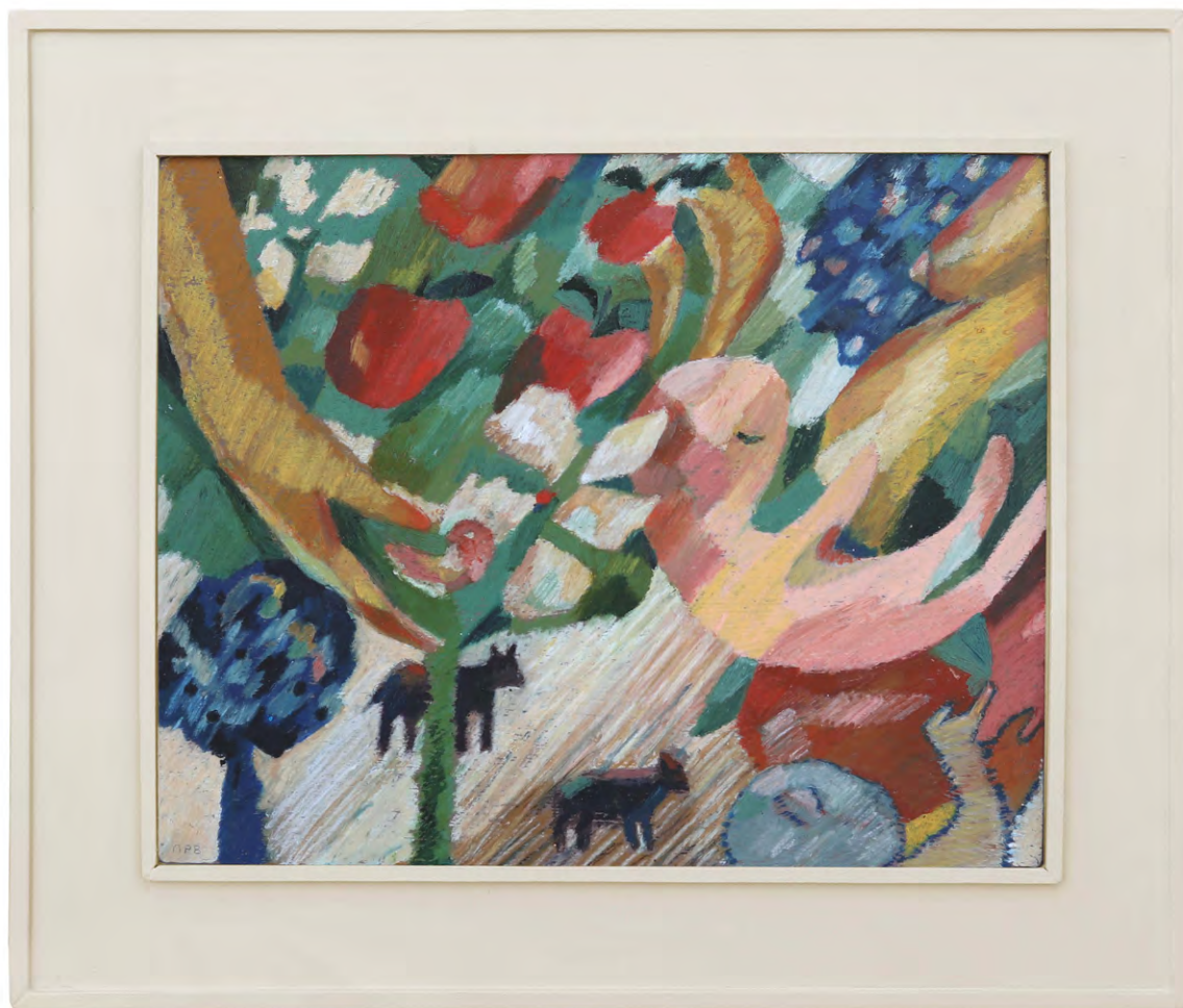
Woman as fruiting tree by Natalie Bessell Oil pastel on wood, wooden frame 49x43cm $980