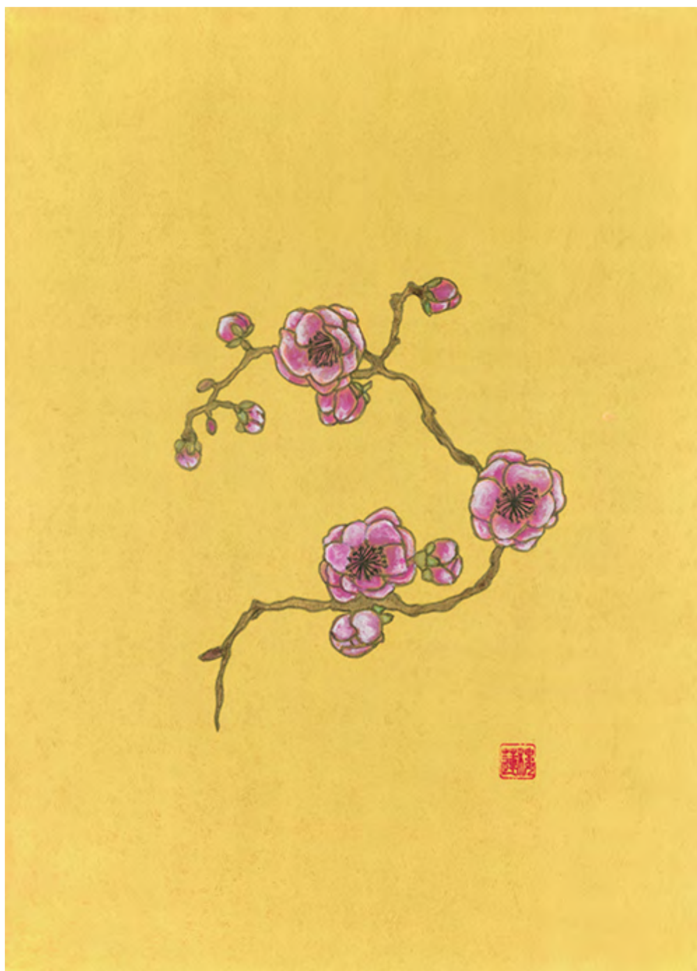
Spring Blossom by Lauren Ottaway Crushed pigment and oyster shell on silk board, framed 30cm x 39.5cm $250