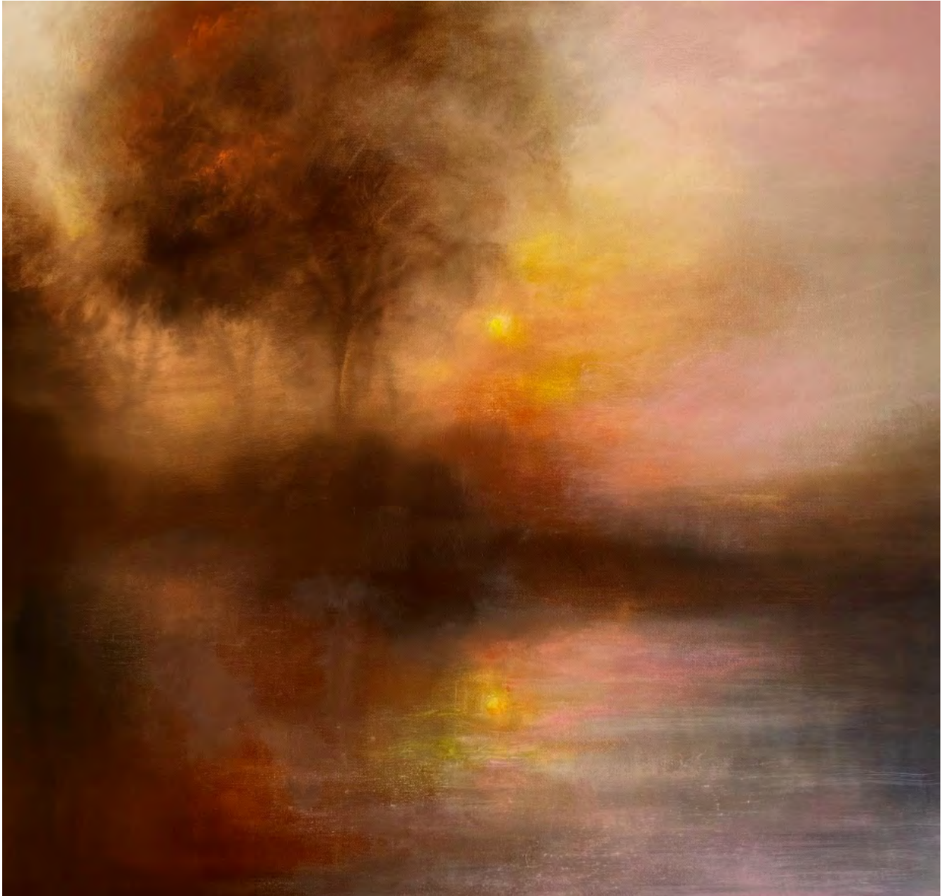
Warm Caress by Cathy Yarwood-Mahy Oil on canvas 76 x 76cm $900