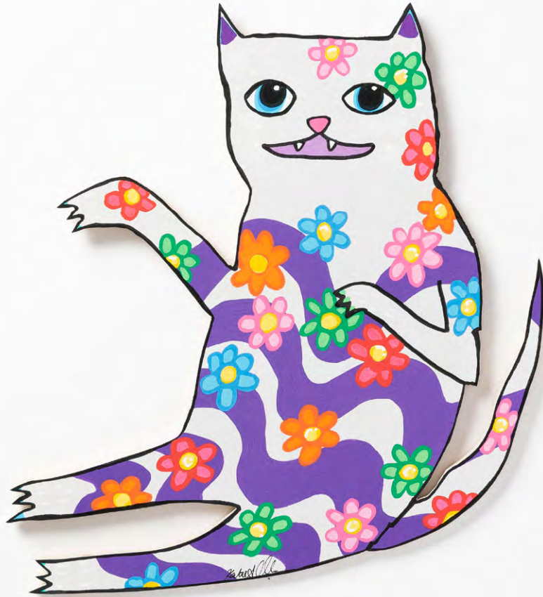
Agatha by Katie Chancellor Acrylic on cut out wood 40 x 29cm $300