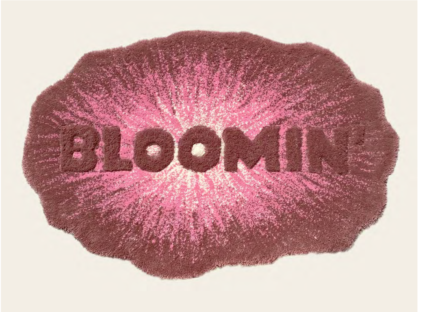
Bloomin' by Gala Jane Tufted wool yarn wall rug 40x60cm $490