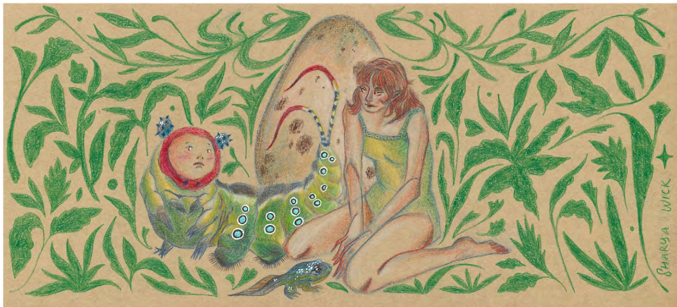
Late Bloomers by Sharya Wick Coloured pencil on paper, framed 13.5x30cm $280 SOLD