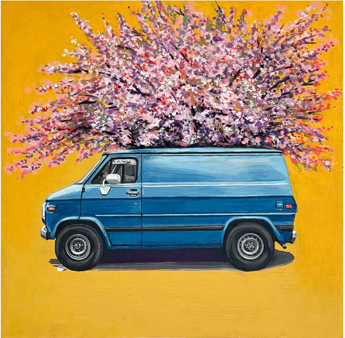
Bedford and Blossoms by Stephen Doan Acryla Gouache on Timber Panel 20cm x 20cm $790 SOLD