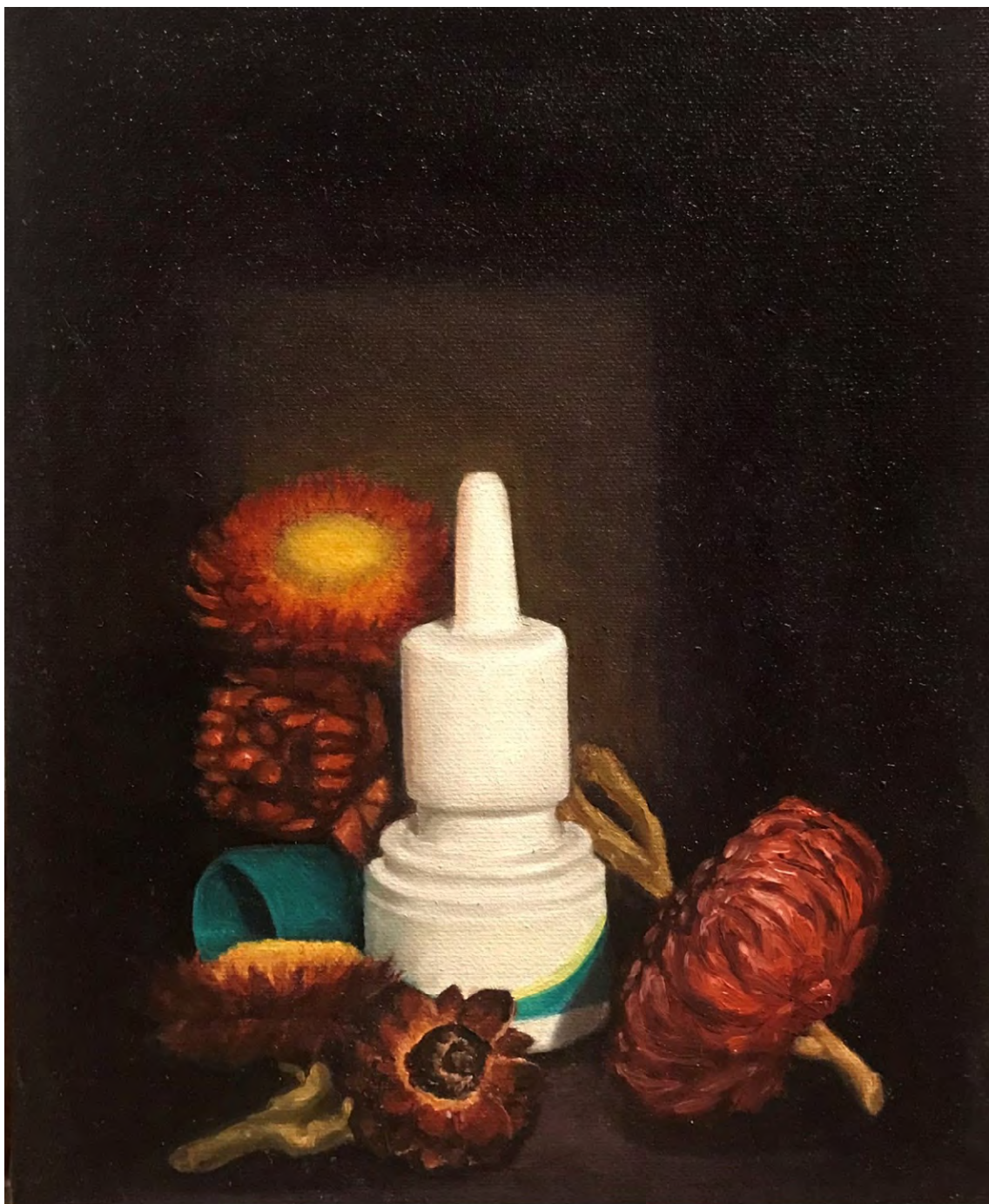
Time of the Season by Julia Novella Oil on canvas 10 x 8 inches $200 SOLD