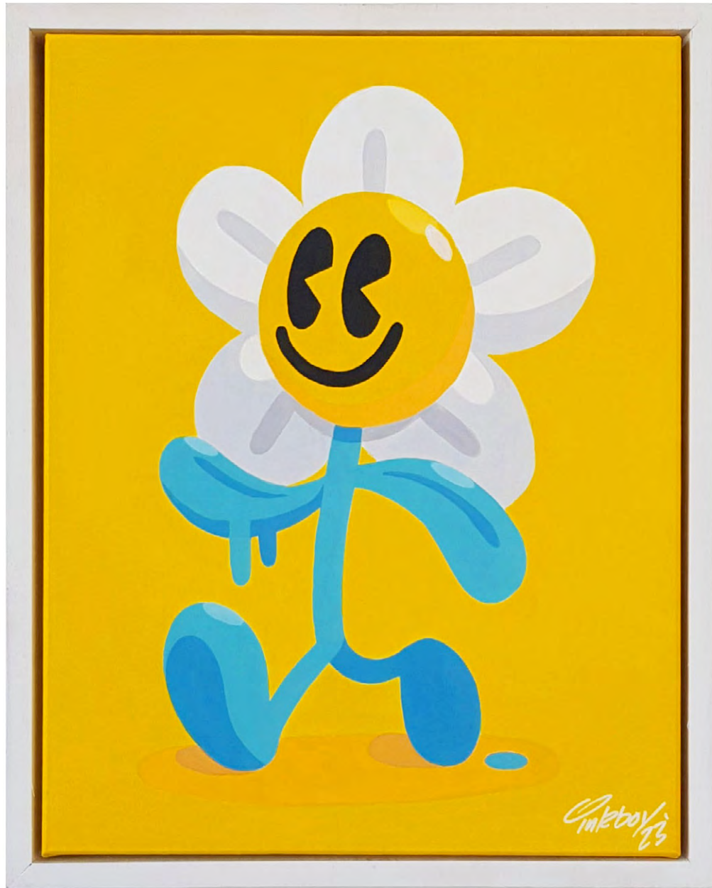
Spring has Sprung by Inkboy Acrylic on Canvas framed 32 x 38cm $500 SOLD