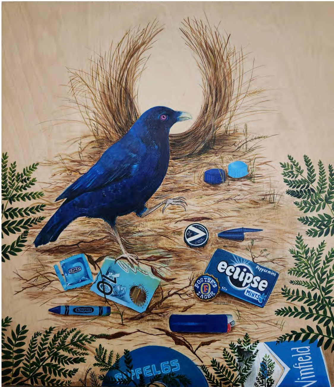
One Man's Trash by Helena Black Acrylic on cradled wood panel 35cm x 40cm $550