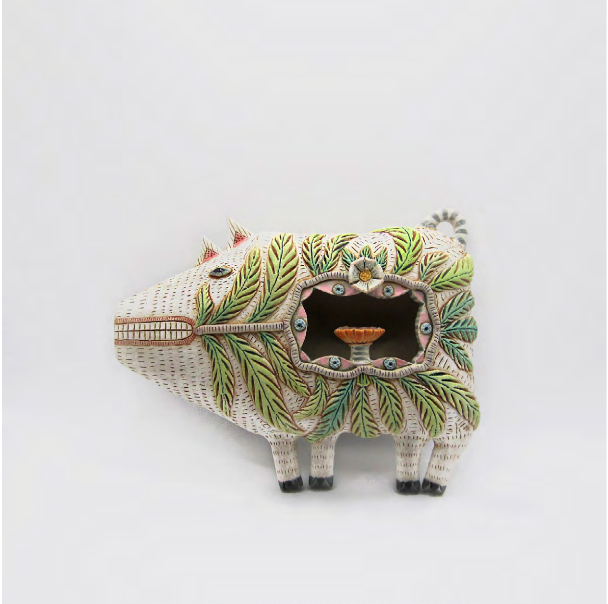
Pigface by Yen Yen Lo Raku clay, Underglazes, Glaze, Oxides 15cm (L) x 10.5cm (H) $400 SOLD