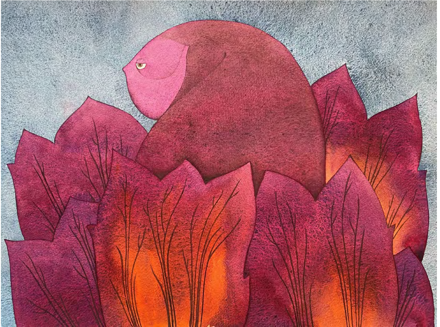
Predawn by Aaron Condon Watercolour and pencil on paper, framed 62 x 45cm $400