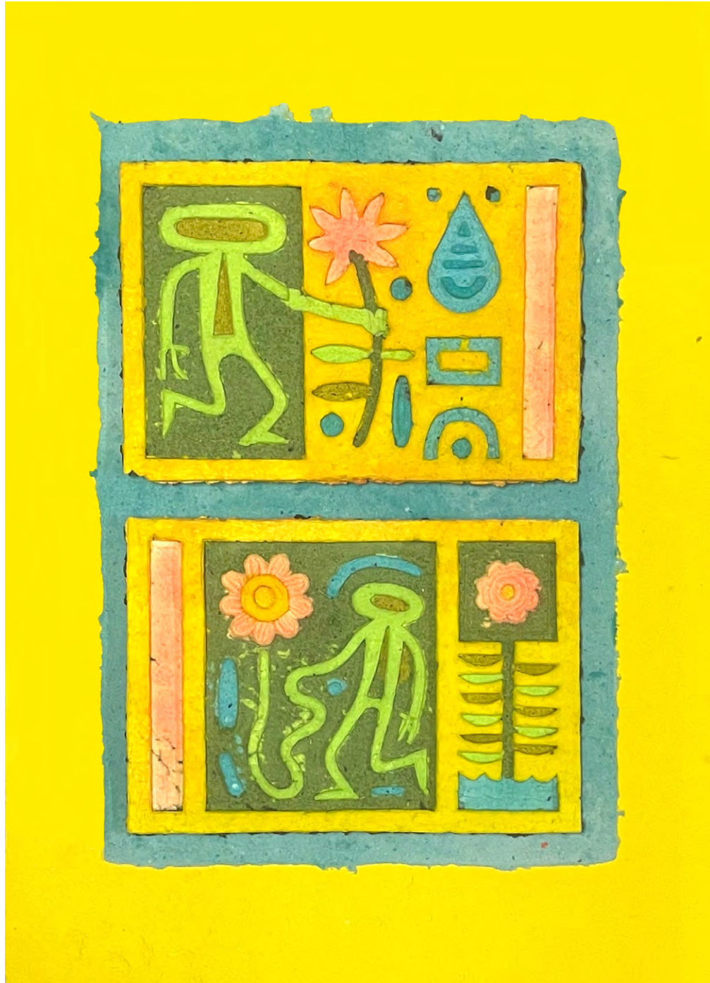
Human Blooming by Chehehe Recycled ( dodgy ) paper pulp relief print / hand carved block 31cm x 42cm x 1cm $450