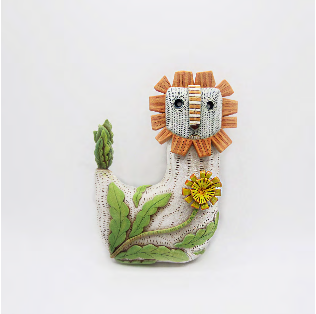
Dandelion by Yen Yen Lo Raku clay, Underglazes, Glaze, Oxides 14.7cm (H) x 9cm (W) $310 SOLD