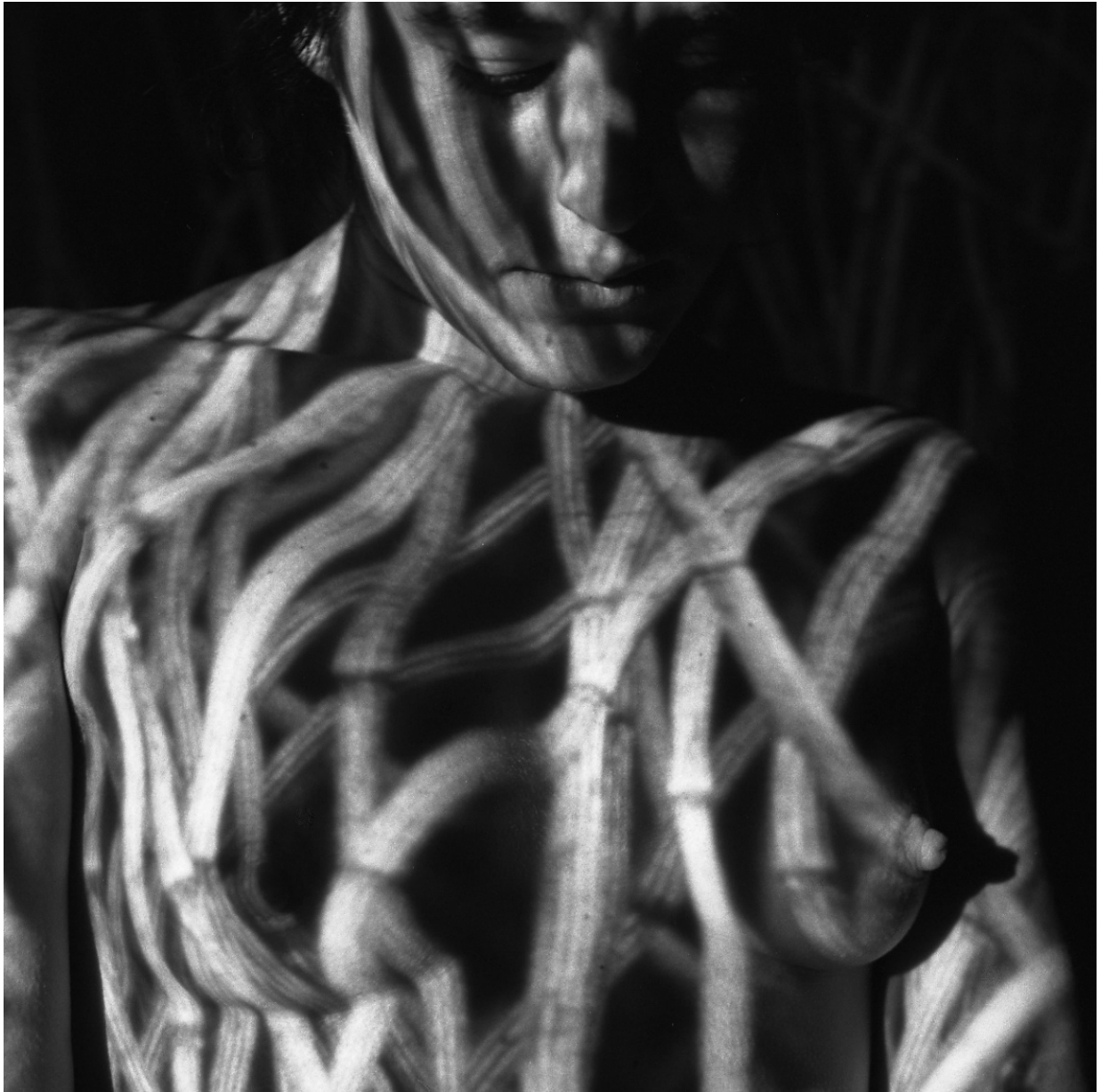
Projected Image by David Tatnall silver gelatin print, framed 48.5 x 43.5cm $800