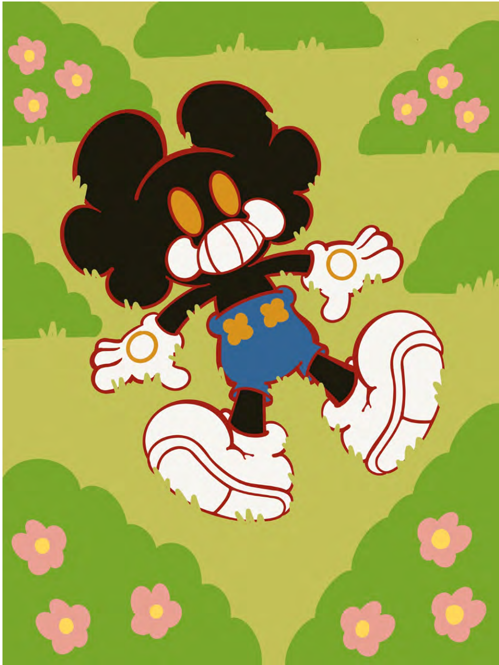
Shady by Asooraguy Acrylic on canvas 60x50cm $750