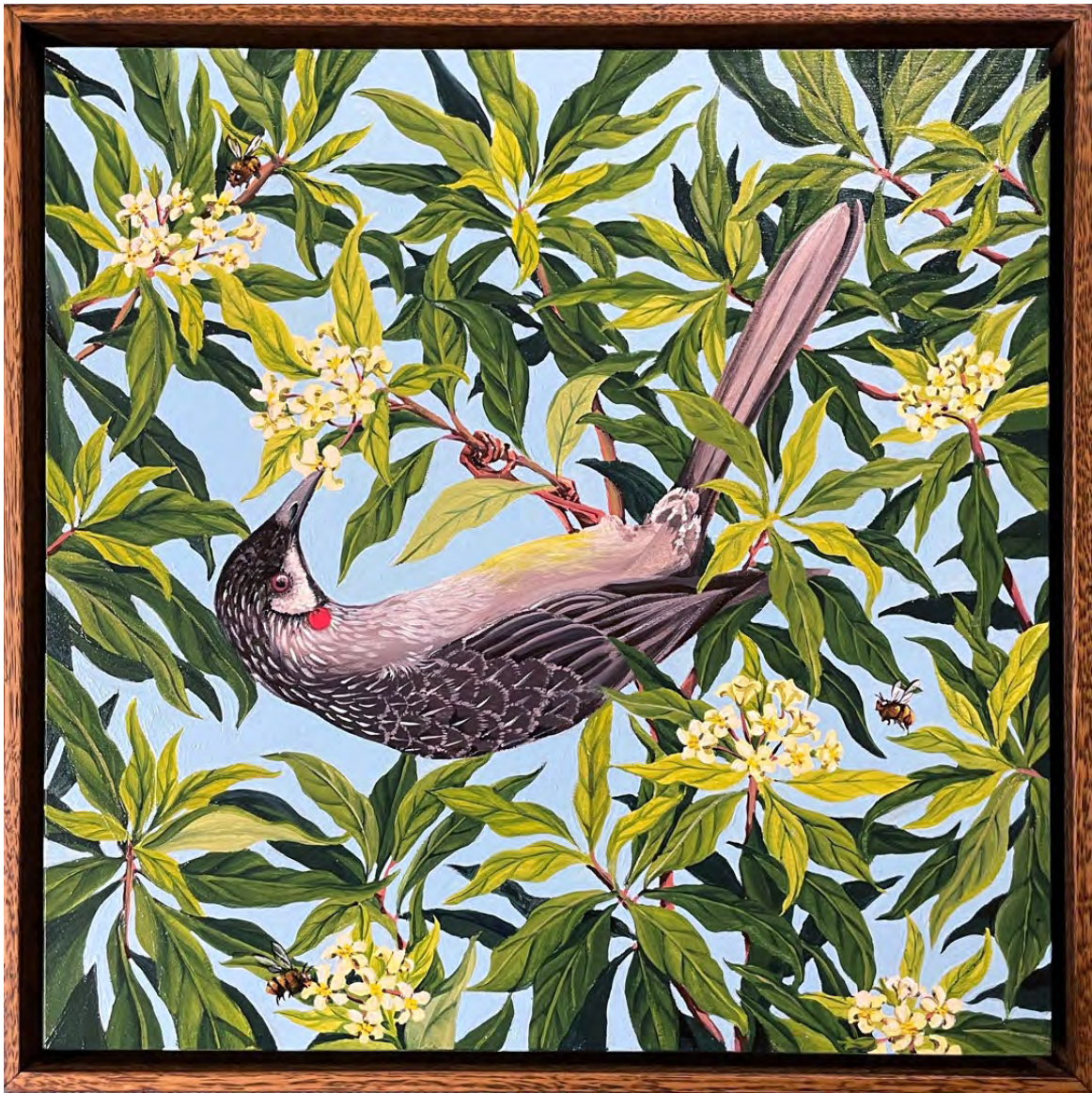
Neighbours by Daniele Lugli Medium: acrylic on marine ply, framed 32x32cm $450 SOLD