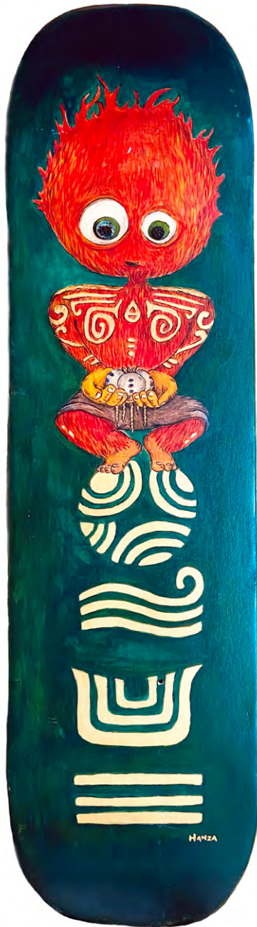
Burning Sprite by Priscilla Ong acrylic on skateboard deck 20x80cm $555

The Pagan Beltane festival celebrates spring at its peak, being a symbolic gesture to entice the return of the growing power of the sun. Participants ignite bonfires, dance and jump over flames to be purified and be bestowed protection. Priscilla alludes to the presence of the fire element of the festival through visualising a cleansing generous life-giving fire spirit. This metaphorical whimsical character offers a plant to assist the commencement of rich growth and harvest. The skateboard, and the implied use of them for airborne tricks, suggest a contemporary take on jumping over the flames, with a colour palette and mark marking reminiscent of an ancestral era, bridging the past to the future.