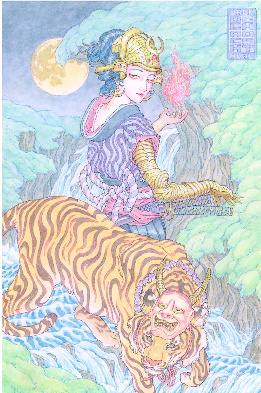
Moon priest by Jack Howl Ink and watercolour, framed 45x35cm $790