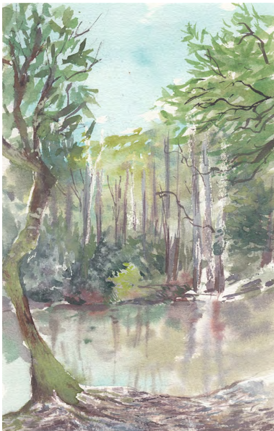
The Lake to the Sky by Anne Kucera Plein air watercolour on Saunders Waterford paper, framed 26.5cm x 17cm $380