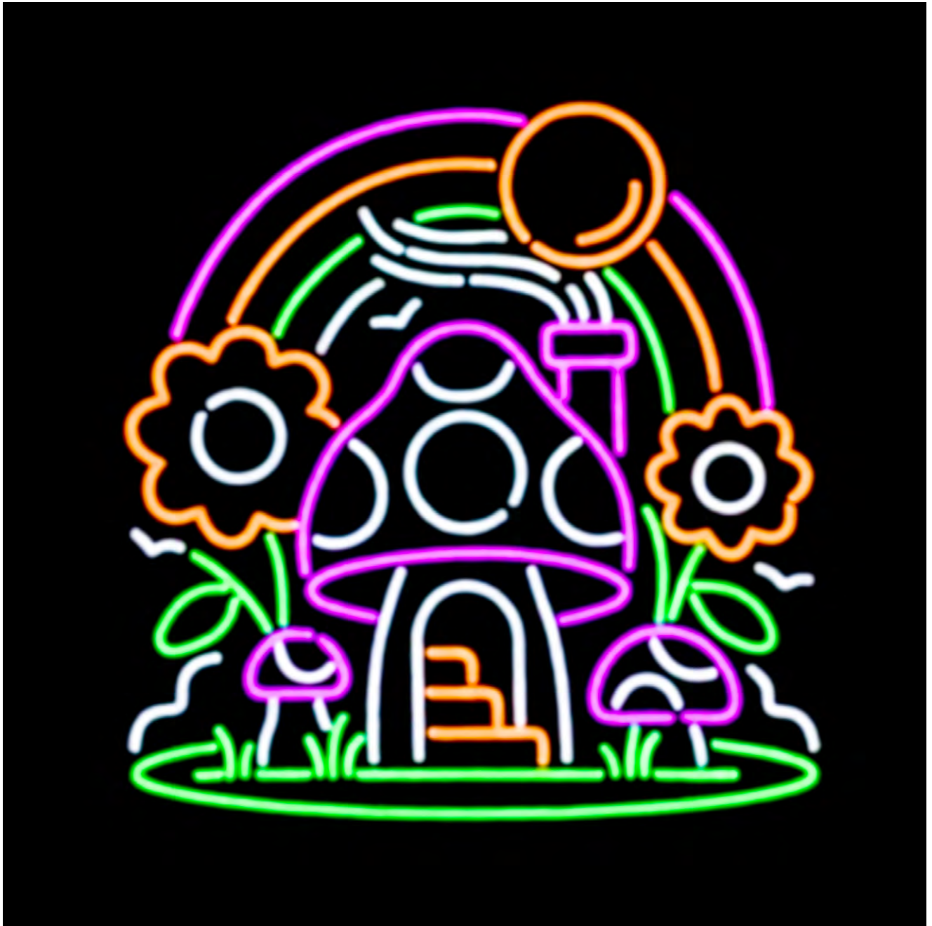
Simpler Times '01 by Chris Costa LED Neon 57 x 60cm $900