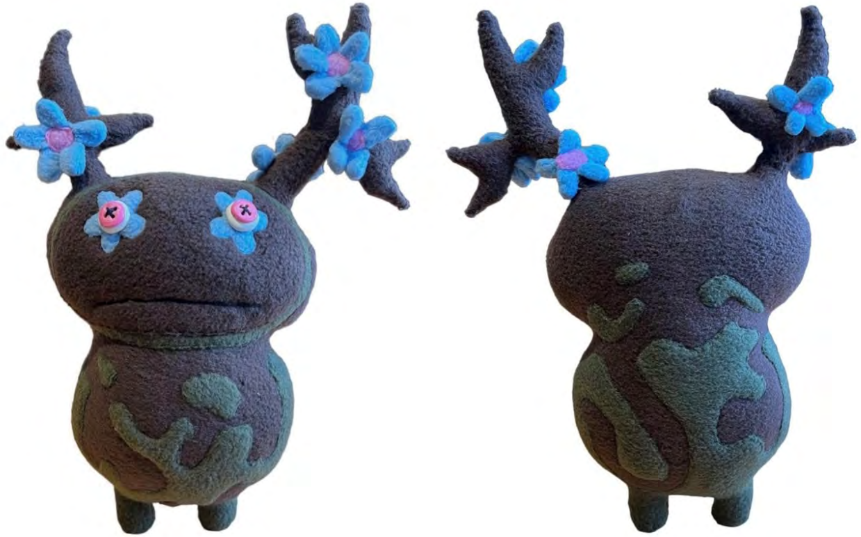
WilderBeast #014 by Saint Jive Hand-sewn Soft Sculpture 25cm H $200

Likes: Being generally pessimistic, gloomy, and depressed, overcast weather and rain, sarcasm, dry humor, and Lo-fi beats. Dislikes: Being alone and birthday parties