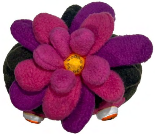
Wilder-Beast #013 by Saint Jive Hand-sewn Soft Sculpture 25 cm H $200

Likes: People watching (Always daydreaming of every passerby's life story), bathing in glow of the sun, and classical music (Once having the dream of playing in the Vienna Philharmonic, but unfortunately never grew arms) Dislikes: Getting rain on their parade and out growing a pot