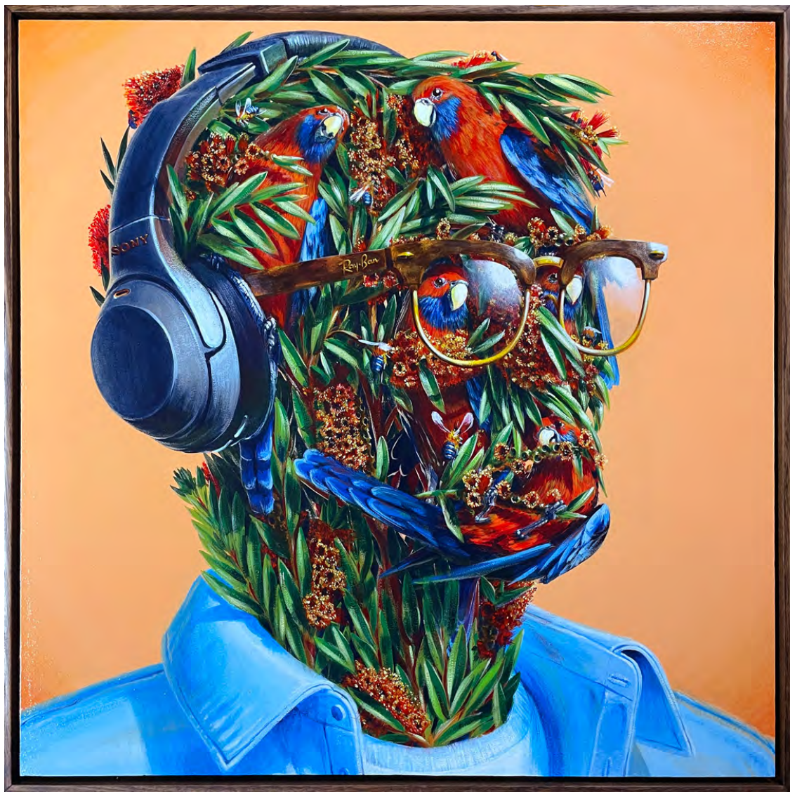
Spring Daze by Glen Downey Acrylic on aluminium composite, framed 62.5cm x 62.5cm $2500 SOLD

OPENING: Fri 29 Sep 6-8pm DATES: 28 Sep - 12 Oct 2023