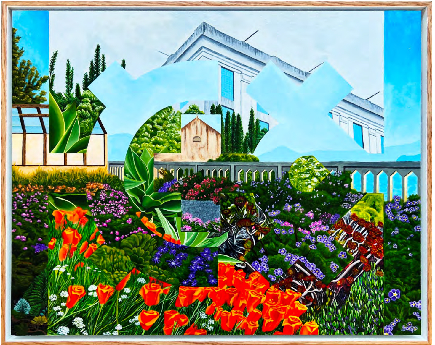
Rebirth at Alcatraz by HWJ Acrylic on birch board, framed in natural Tasmanian Oak 52.5cm x 42.5cm $1250

Continuing with his recent exploration of abstracted realism, HWJ chose to feature Alcatraz Prison in San Francisco bay. Enamored with the juxtaposition of the scene, a once violent, intimidating and oppressive place, he was fascinated with how it has been rebirthed into something covered in beauty and positivity. Now splashed with colour and housing wide variety of flowers and plants, 'The Rock' as it was once called, has been transformed into a garden paradise, providing a welcoming environment for tourists and explorers a like to enjoy the storied history of Island.