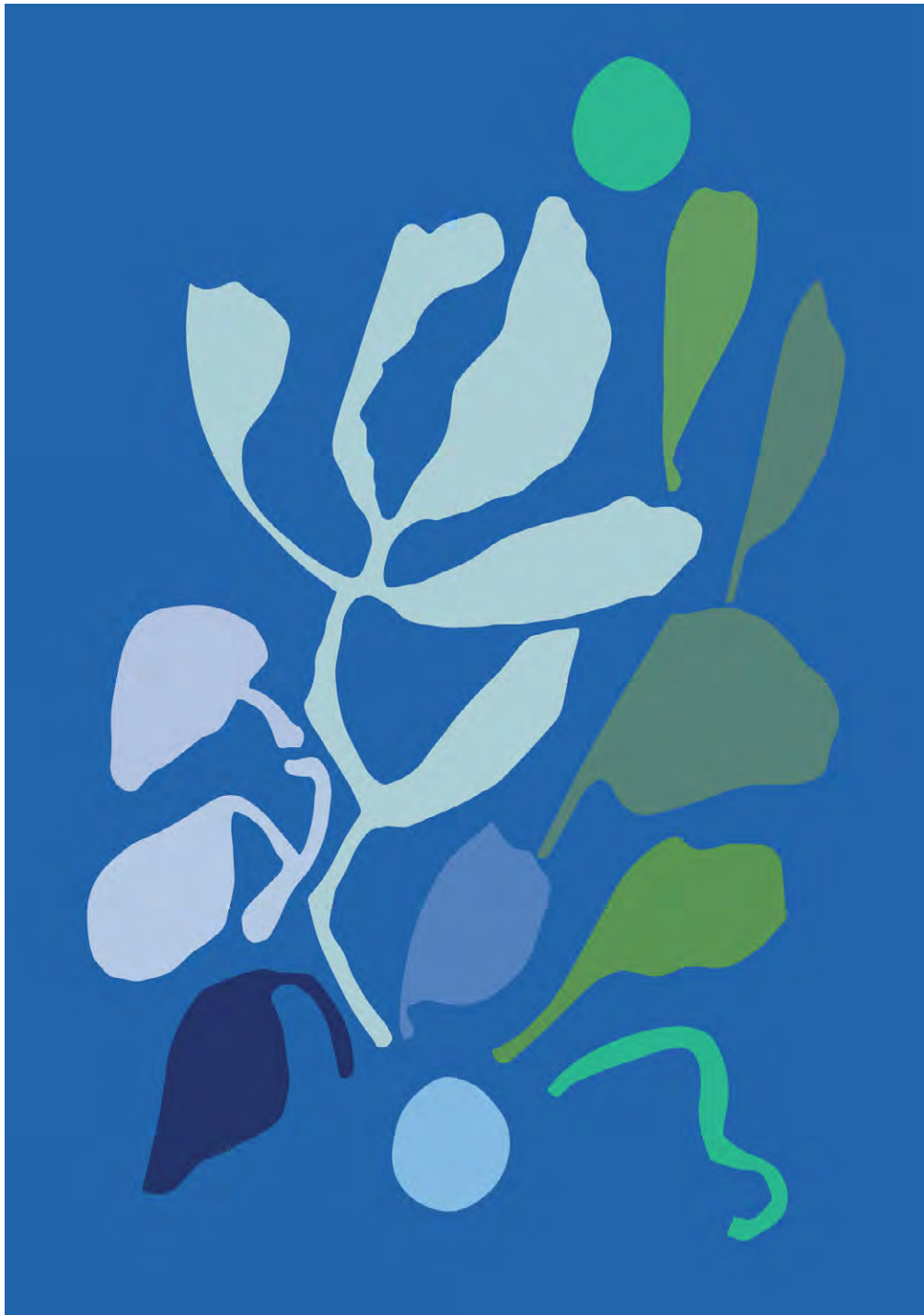
Emerald City by Simone Lovett Limited edition print 1/50, hand signed and numbered, framed 42 x 59cm $375 SOLD