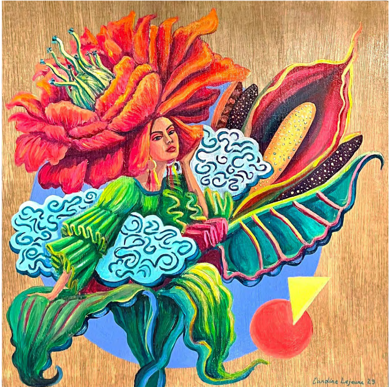
La femme en fleur by Caroline Le Jeune acrylic on panel, Framed 40cm by 40 cm $580