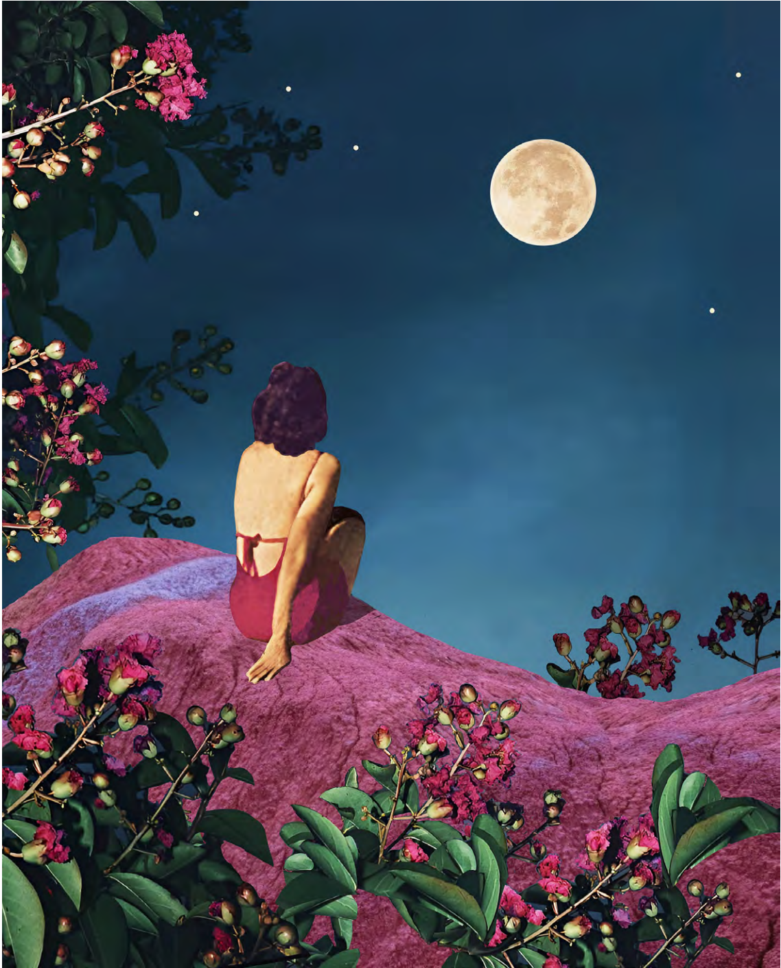
Sugar Moon by Rachel Derum paper collage, framed 42cm x 32cm $550