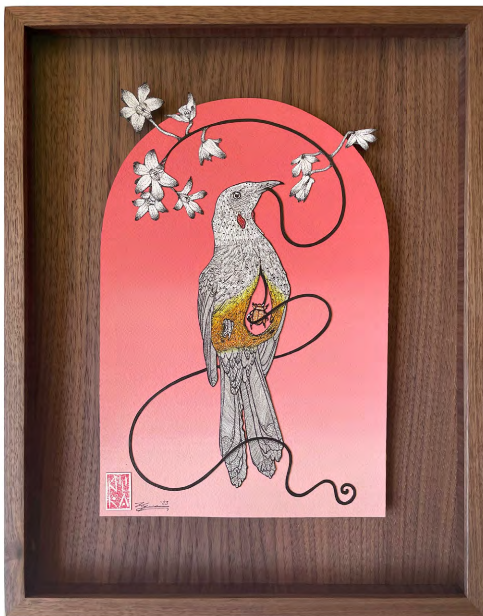
Wist-full by Kyra Hannah Archival ink, pencil, copper foil, gouache on hand-cut paper in floating frame 41 cm x 31 cm $700

Wist-full explores core memories from the artist's childhood and adolescence. Deeply aware of the interconnectedness of our ecosystems, Kyra uses the black stem of the rock orchid to link together various species of the food web, who may all rely on each other for sustenance. The Christmas beetle at the heart of the red wattle bird signifies a time growing up in Queensland when the advent of spring heralded these insects landing on faces and hands, like fallen stars.