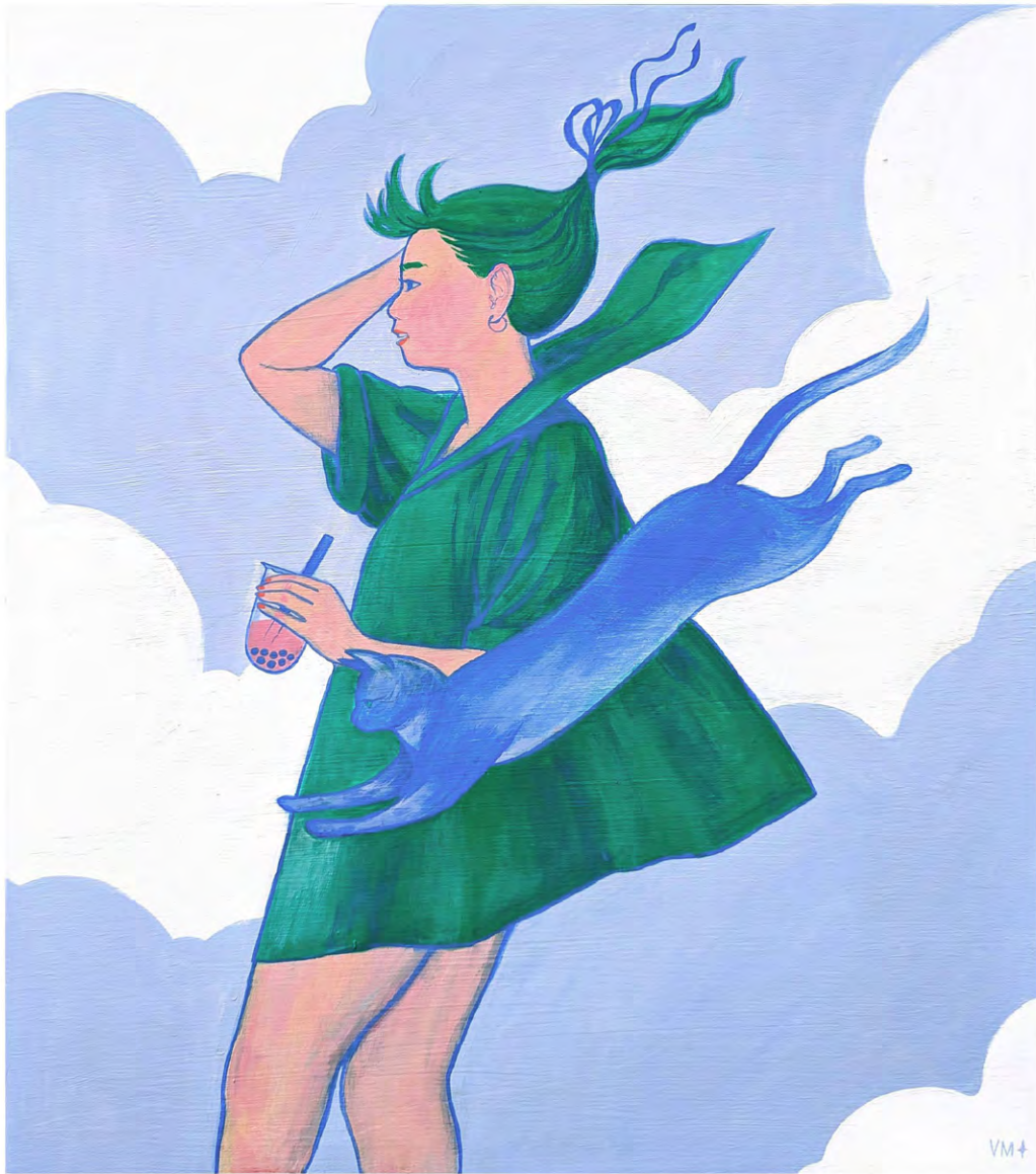
Flying High by Viet-My Bui Acrylic & gouache on panel 35cm x 40cm $725 SOLD