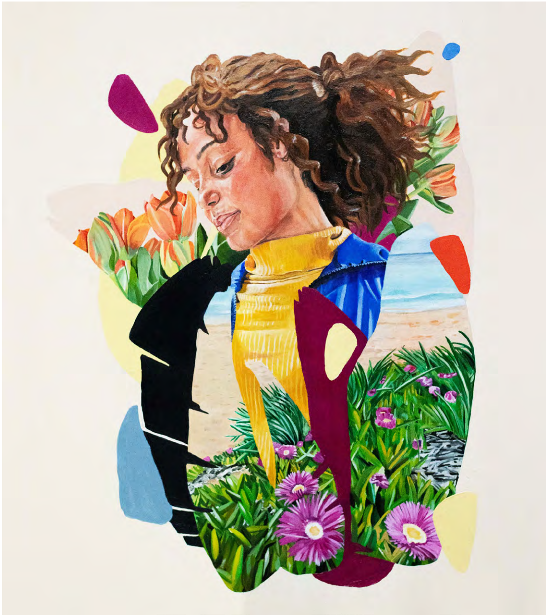
Swan Song by Kim Kermode Acrylic on Birch Plywood 40 x 45cm $600

'Swan Song' by Kim Kermode is a painting that alludes to her love for fragile springtime flowers in nature. As the title suggests, the colourful beauty we witness in nature might be one of the last times we are able to see it in its abundance as the climate continues to shift and change.