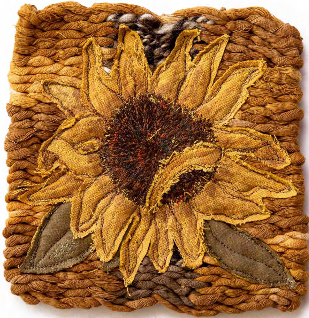
Light, Dark, Light wall - hanging free machine embroidery on hand dyed cotton,, weaving $180