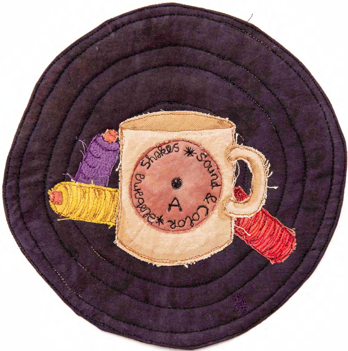
Sound & Colour wall - hanging free machine embroidery on hand dyed cotton stained with hand made nature dye $180