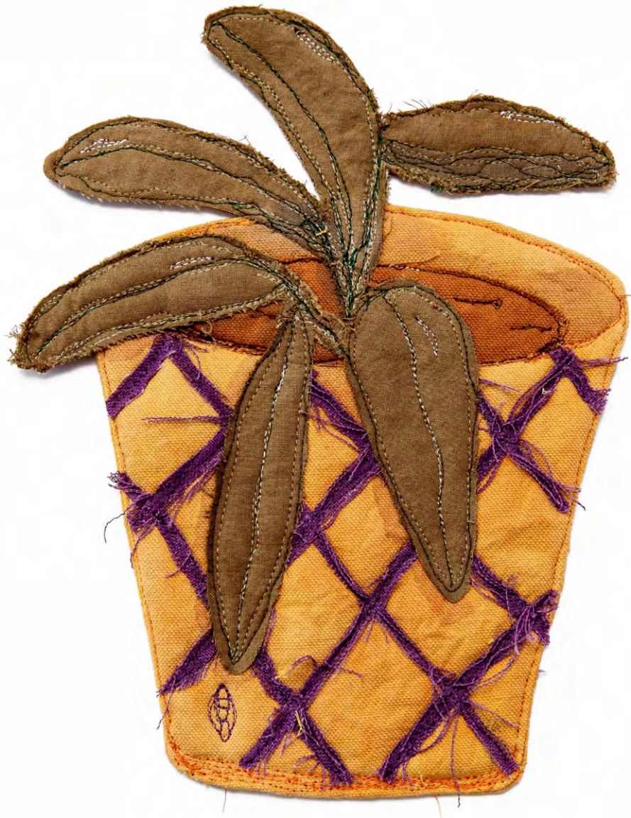
Empty Chairs wall - hanging free machine embroidery on hand dyed cotton stained with nature dye. $180