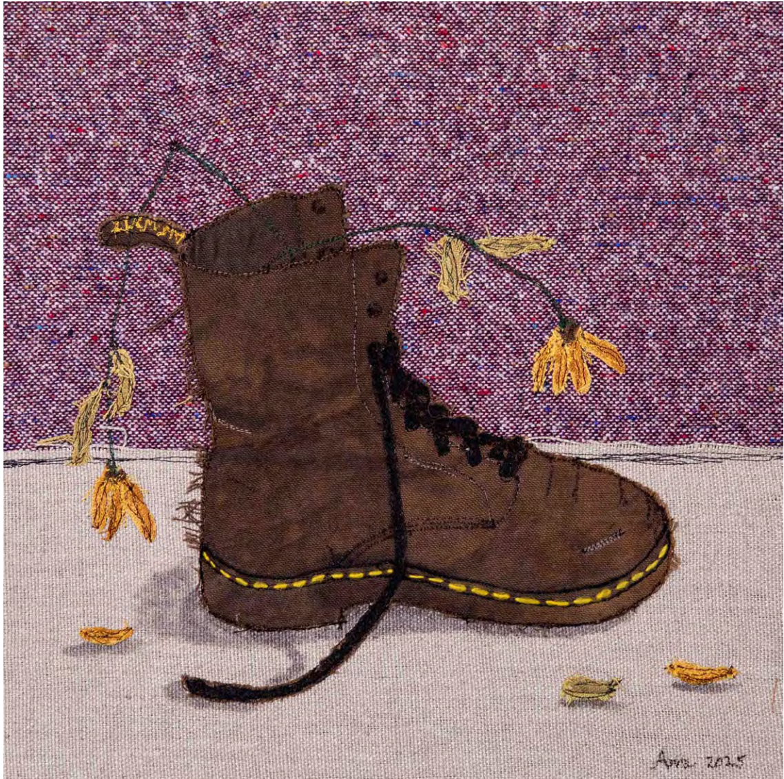
'Tired & Worn out' (2025) Inspired by: Portishead - Threads 30 x 30cm free machine embroidery, reclaimed canvas & textile stained with handmade ink & dye $425