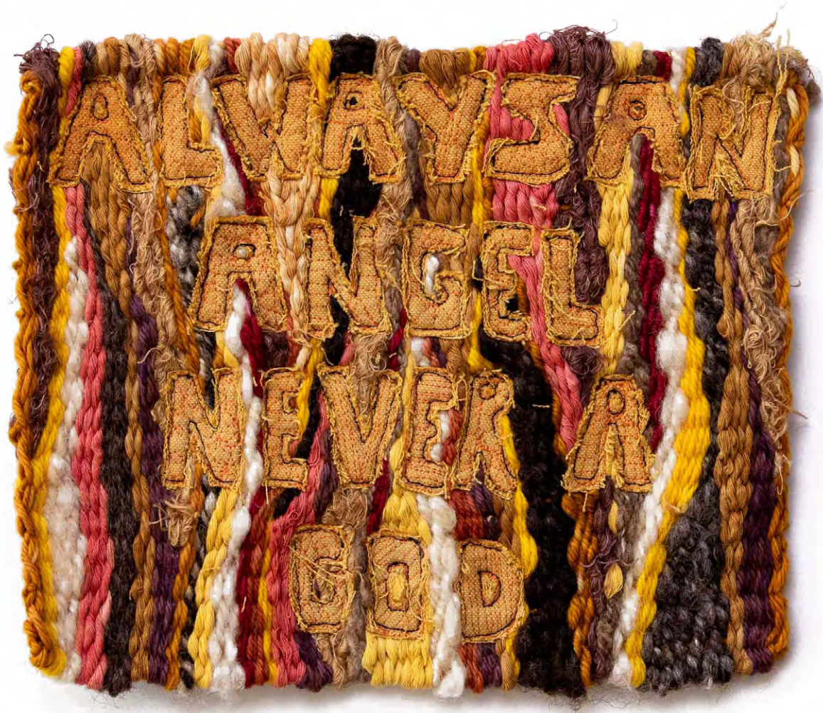
Never Enough wall - hanging free machine embroidery on hand dyed cotton, weaving $180