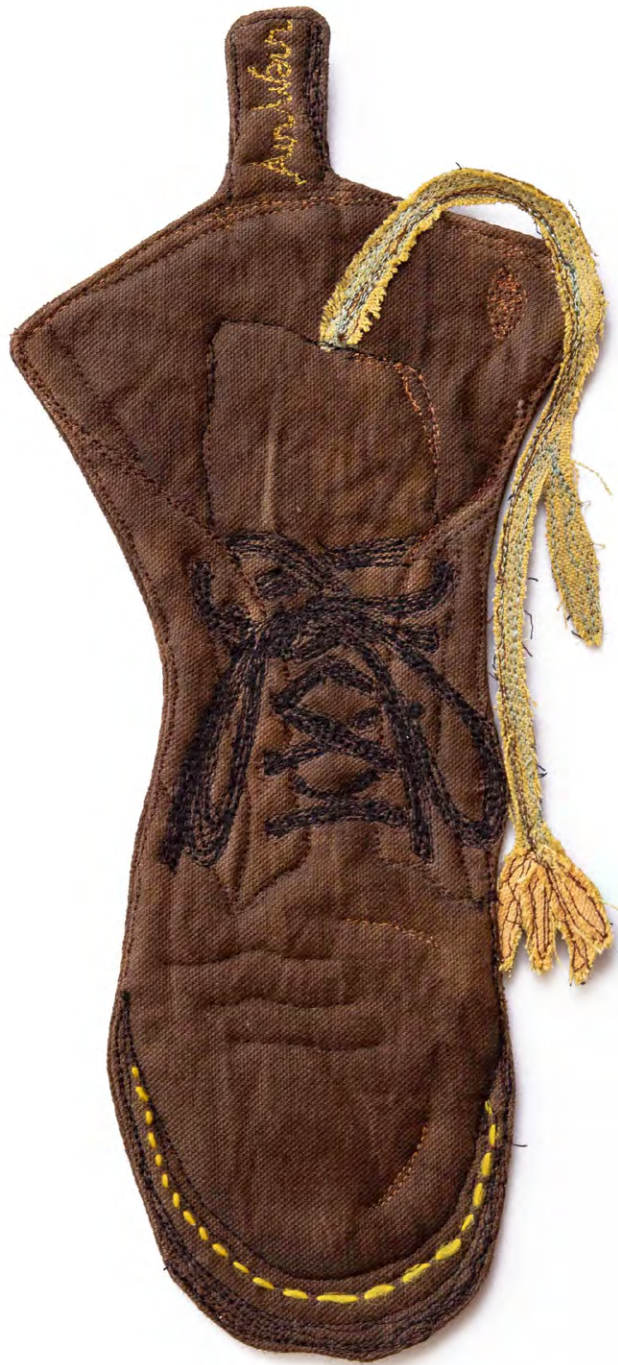
Tired and Worn wall - hanging free machine embroidery on hand dyed cotton stained with nature dye. $180