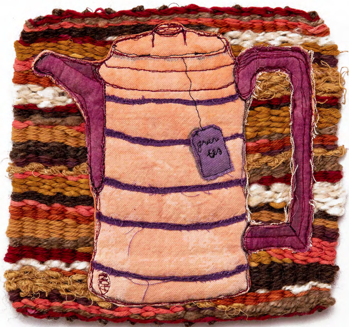
Love, try not to let go wall - hanging free machine embroidery on hand dyed cotton, weaving $180