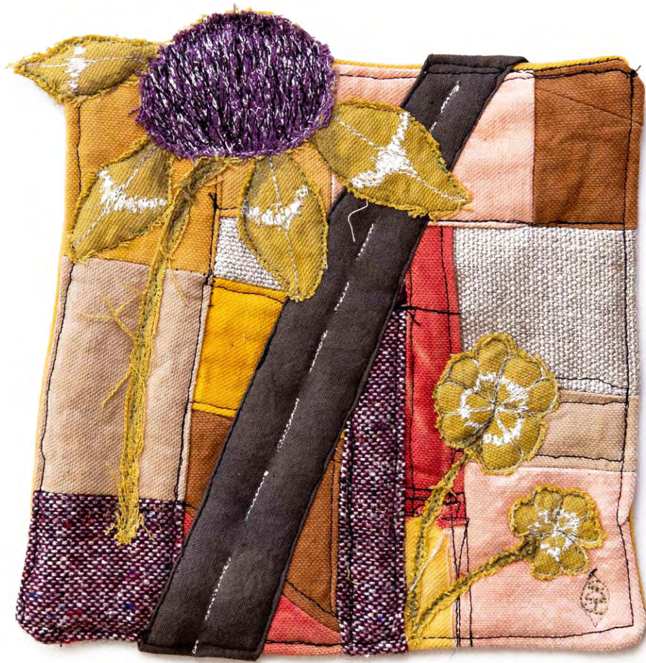
She is just the former one of me wall - hanging free machine embroidery on hand dyed cotton stained with hand made nature dye $180