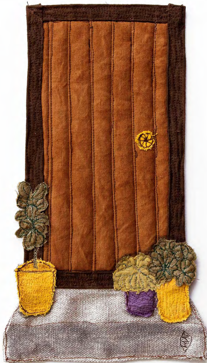
Like a Door wall - hanging free machine embroidery on hand dyed cotton stained with hand made inks $180