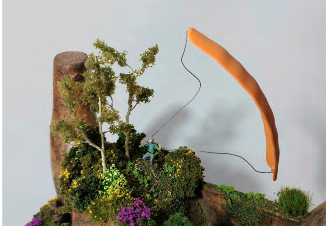
After hoping for a smooth finish, Jack had a close shave, narrowly missing the dense wood. by Tinky Vintage timber hand plane, clay, faux landscape, miniature figurine $350 SOLD