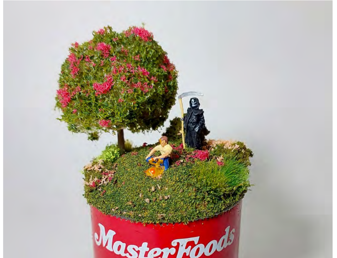
After ingesting some unsavoury luncheon meat, things were looking grim for Tony. by Tinky Vintage 'Devilled Ham Spread' tin, clay, faux greenery, miniature figurines, cloche $220 SOLD