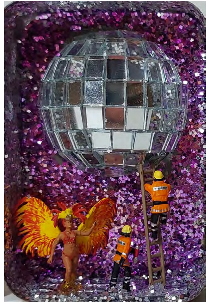
After Yasmin's mirror-ball stopped working, she was relieved to call in the disco-techs. by Tinky Vintage tin, mirror ball, mirror tiles, glitter, miniature figurines $170 SOLD